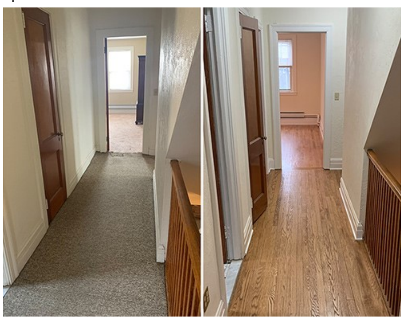
An upstairs hallway in the rectory is pictured before and after the Knights removed yards of carpeting and cleaned the wooden flooring